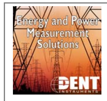
150x150 static or animated button (sample)

Feature Your Company in the e-Newsletter